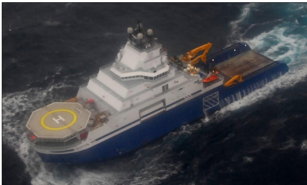
Figure A-8. Commercial Ship Aiviq

Source: Cropped version of photograph accompanying “Aiviq,” Wikipedia, accessed April 29, 2022, which states that the photograph is dated December 30, 2012, and credits the photograph to U.S. Coast Guard Petty Officer 3 rd Class Chris Usher.