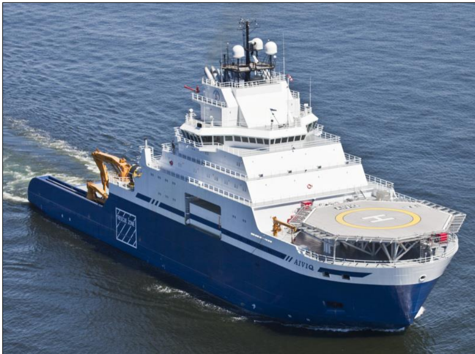
Figure A-7. Commercial Ship Aiviq