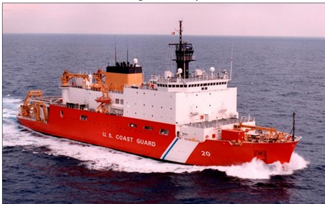
Figure A-3. Healy