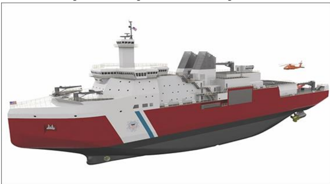
Figure 1. Rendering of Halter Marine Design for PSC

Source: Illustration accompanying Sam LaGrone, “UPDATED: VT Halter Marine to Build New Coast Guard Icebreaker,” USNI News , April 23, 2019, updated April 24, 2019. The caption to the illustration states “An artist’s rendering of VT Halter Marine’s winning bid for the U.S. Coast Guard Polar Security Cutter. VT Halter Marine image used with permission.”