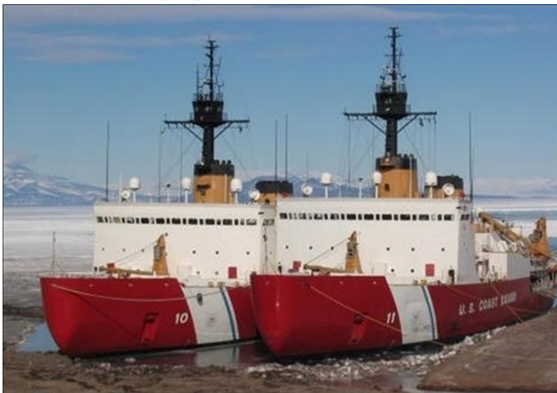
Figure A-1. Polar Star and Polar Sea (Side by side in McMurdo Sound, Antarctica)

Source: Coast Guard photograph that was accessed on April 21, 2011, at http://www.uscg.mil/pacarea/cgcpolarsea/history.asp (link no longer active). The photograph accompanies Kyung M. Song, “Senate Passes Cantwell Measure to Postpone Scrapping of Polar Sea Icebreaker,” Seattle Times , September 22, 2012, posted at http://blogs.seattletimes.com/politicsnorthwest/2012/09/22/senate-passes-cantwell-measure-to-postpone-scrapping-of-polar-sea-icebreaker/ .