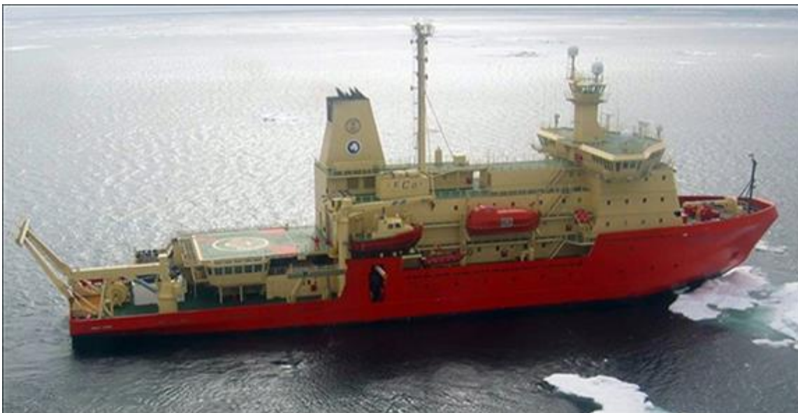
Figure A-4. Nathaniel B. Palmer