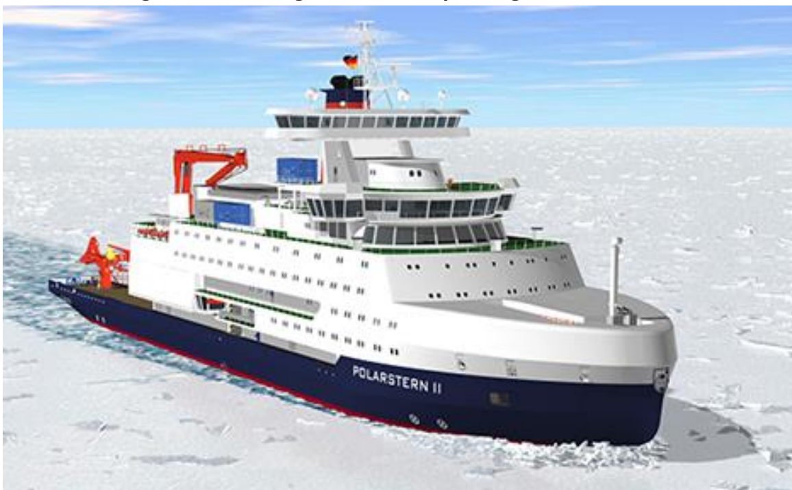
Figure 6. Rendering of SDC Concept Design for Polarstern II