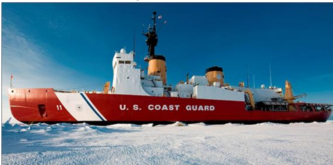
Figure A-2. Polar Sea