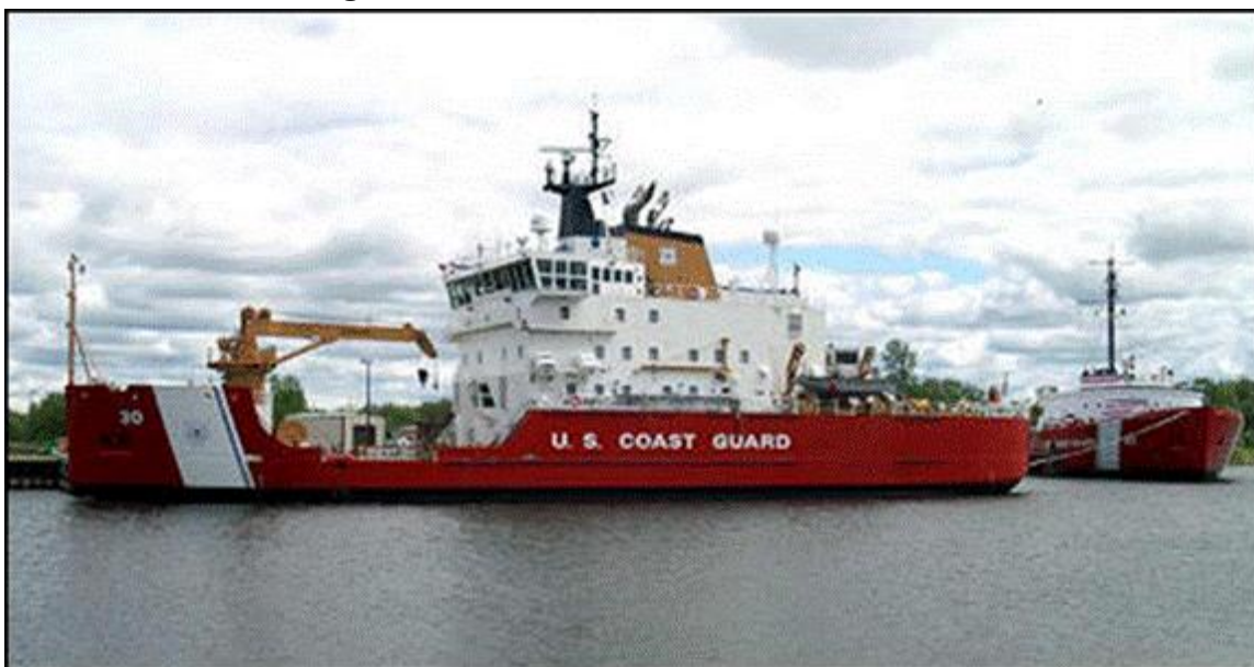
Figure 7. Great Lakes Icebreaker Mackinaw