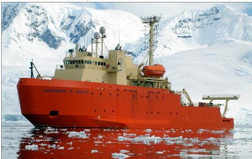
Figure A-5. Laurence M. Gould